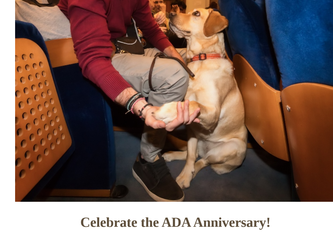
On July 26, 1990, the American with Disabilities Act was signed into law. This

landmark legislation is now a bastion for the protection of people with disabilities. For 33 years, it has made life better for people with disabilities in the United States in various ways. Thanks to ADA, people with disabilities can enjoy many activities without